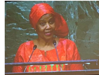
Under-Secretary-General Pfumzille Mlambo Ngzuka & Executive Director