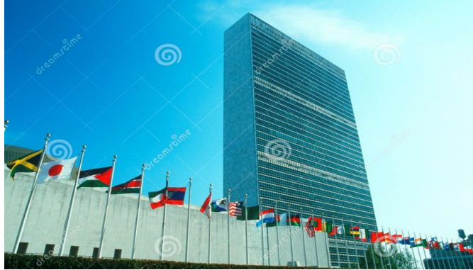
UN Main Office New York