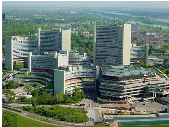
UN Office in Vienna