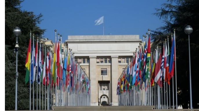
Palace of Nations Geneva; also ILO