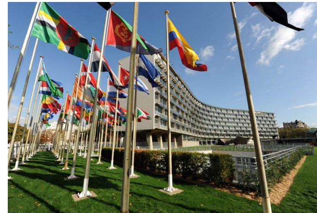
UNESCO in Paris