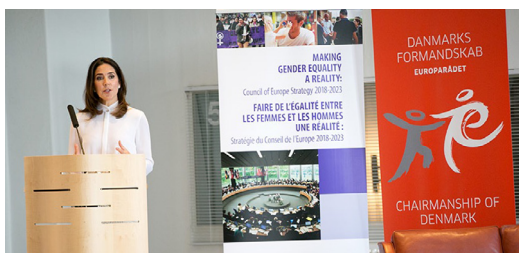
Her Royal Highness the Crown Princess Mary of Denmark.