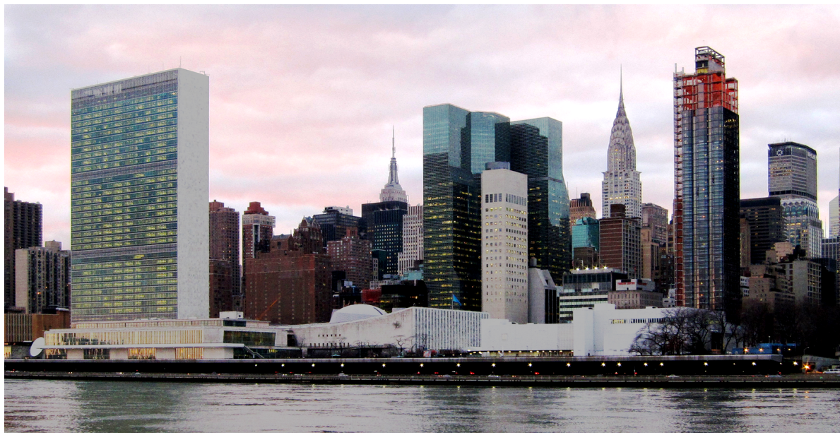
United Nations Headquarters in New York City, view from Roosevelt Island.

The United Nations is an international organization founded in 1945. It is currently made up of 193 Member States. The mission and work of the United Nations are guided by the purposes and principles contained in its founding Charter.