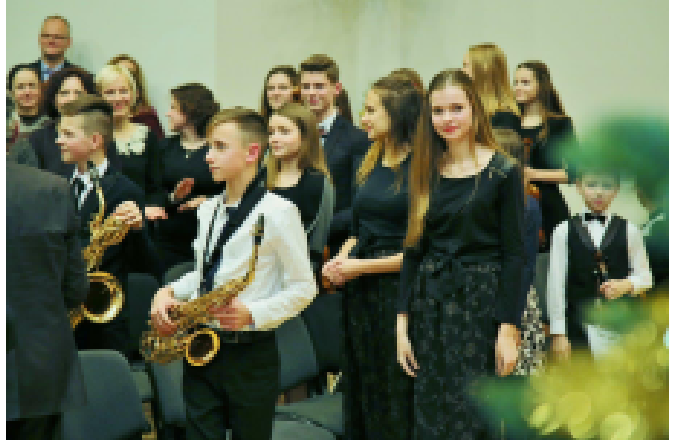
Alytus. Fundraising event together with Rotary and Lyons.