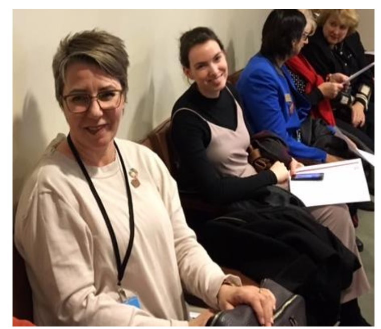
D-13 Zontians in CSW 2017: Governor Ingibjörg Eliasfottir and Cecilie Gulbrandsen, Stavanger Zonta Club.

The NGOs are important for critical evaluation of progress or lack of progress. Stronger obligation for the nations is necessary to fulfill the SDGs and the Beijing Platform for Actions from the 4<sup>th</sup> UN Women Conference.