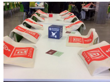
The Zonta Goodie-bags and SDG's cubes on the tables.