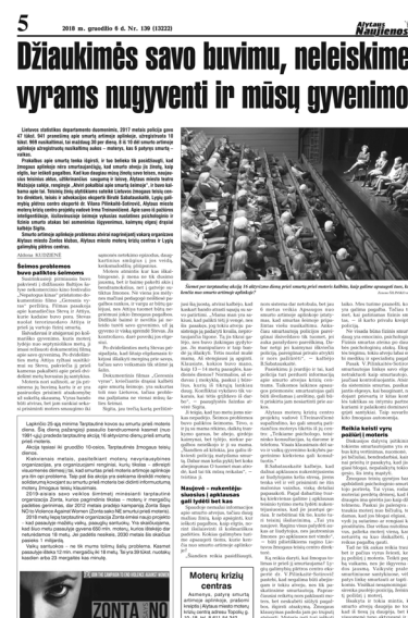
Article about event was published in local paper Alytaus Naujienos (Alytus News).

Speaking about violence is crucially important. Recently Alytus Zonta club had an open discussion about domestic violence and watched a documentary film "A Better Man" (November 29). According to statistics, 80% of women happen to be victims of violence in one way or another. The film revealed hard consequences of physical abuse, and a long and painful way towards healing. In the discussion, we talked about the differences of incidental and systematic violence, how to help the victims. Every year 50,000 calls for help are received in Lithuania, and 1500 cases reach the court. The most important thing is not to remain indifferent, try to help, to ask, to inquire. As we all know, people do not always want to admit the fact of violence or abuse, to accept help, to make a change in their lives, to end abusive relationships. The event was organized by Human Rights Portal www.manoteises.lt , Lithuanian Center for Human Rights, Center for Equal Opportunities Development, Alytus Zonta Club and Alytus City Women's Crisis Center.