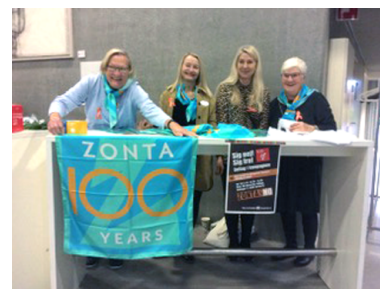
Zontians from Aarhus, Silkeborg and Viborg with the Zonta scarves from Silkeborg Zonta.

The result was a series of inspiring essays, poems, short stories, video productions, social studies papers and plays. The students presented many of these products on stage to an enthusiastic audience November 24 at VIA University College in Aarhus.