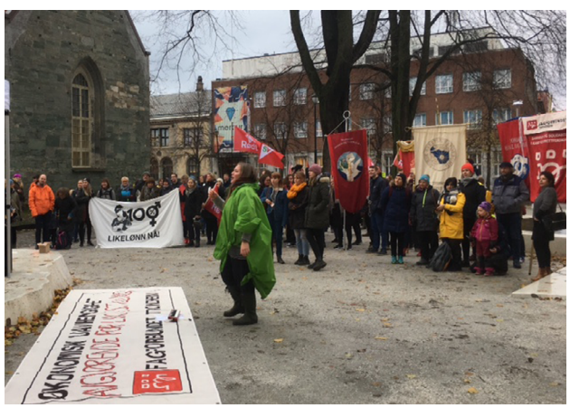
People and organizations at the demonstration.